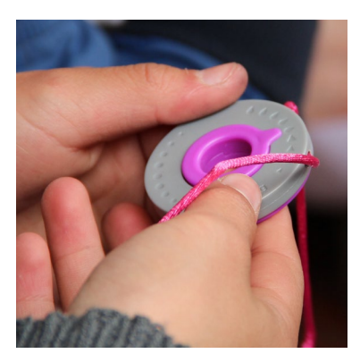
Be Girl's SmartCycle® tool has numbers of the front and icons on the back to teach users to track three phases of the menstrual cycle: menstruation, ovulation, and preparation.

In August 2019, Girls' Center staff conducted consultation sessions with two mothers, six adolescent girls, and six peer educators. The initial feedback was mainly very positive and welcoming to any tool that could help them better understand their own health. These female community members agreed that the SmartCycle® is "a great method to track periods," and expressed