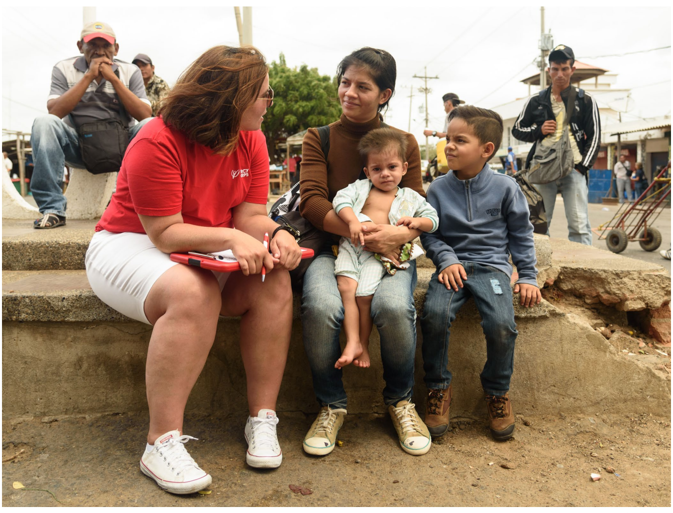
Miguel Samper / Mercy Corps