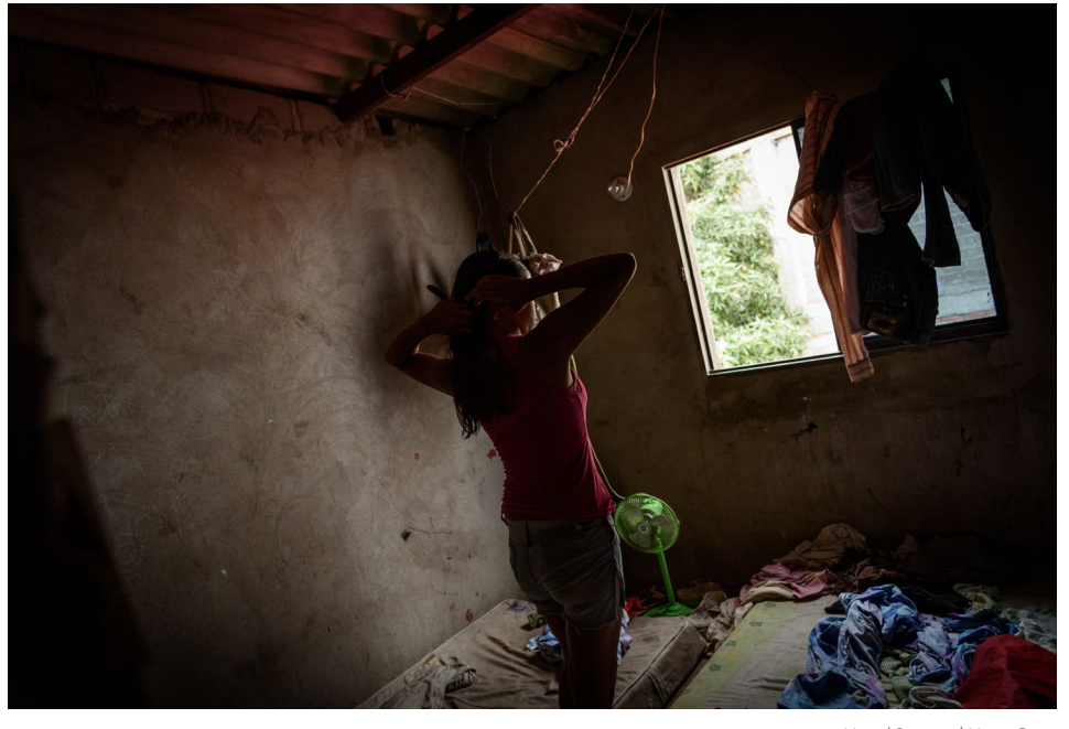
Miguel Samper / Mercy Corps

with a passport as well as those who were irregular but registered with the government in Spring 2018. The PEP allows Venezuelans to reside and work in Colombia for up to two years, and access Colombia's health system beyond emergency treatment.8 As a result, approximately 675,000 Venezuelans have regular status, but an estimated 665,000 Venezuelans still remain irregular, due to having overstayed or having entered the country illegally.9