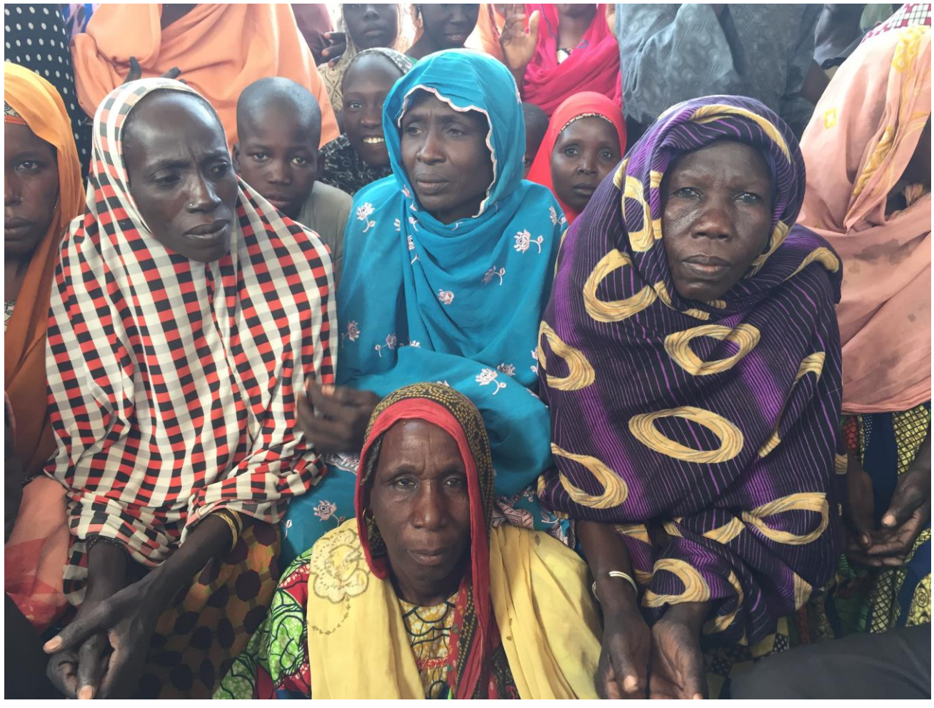
Focus group discussion with displaced women in Sangaya Camp, Dikwa.