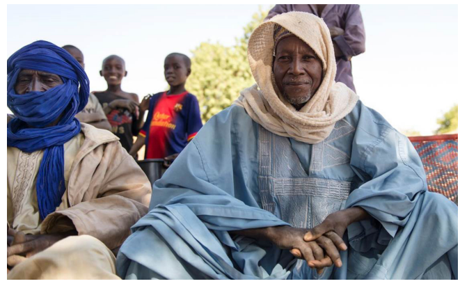
Niger 2016 Mercy Corps