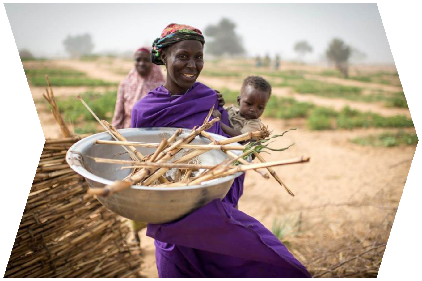
Niger 2014 / Sean Sheridan