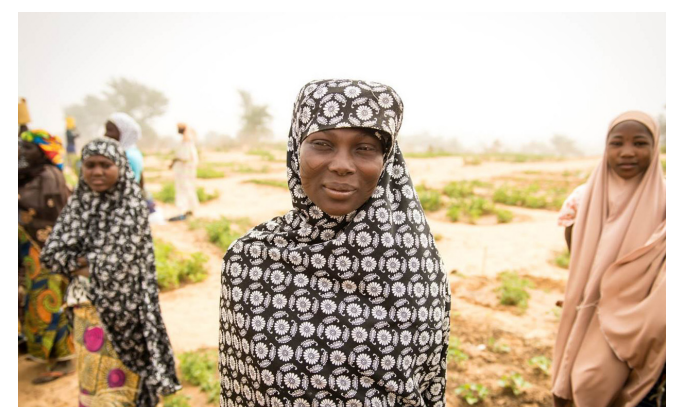
Niger 2014 / Sean Sheridan

Systems that promote stability from local to the national levels are essential to ensuring Niger has the capacity to manage multiple shocks and stresses simultaneously. Inclusive representation in state institutions among all ethnic groups and regions of the country is critical to promoting stability and avoiding fallout from international conflicts spilling over the borders with Mali, Libya, Chad, and Nigeria. Food security efforts should preserve and build on well-established Nigerien traditions supporting strong social cohesion (including across ethnic groups) that provide families with an immediate safety net to deal with shocks, while promoting local stability. Government and religious authorities should strengthen male and female youth groups (e.g., fada, tontines) with conflict mitigation skills to prevent and manage local resource conflicts and support the integration of refugees and internally displaced people.