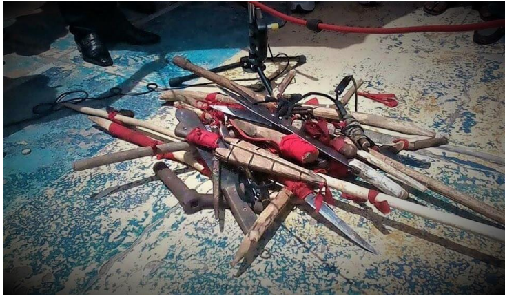
Photo 2: Typical Kamuina Nsapu weapons – sticks, machetes, knives handed in during demobilization of a Kamuina Nsapu group in 2017

This low-grade conflict continued until early 2019, when the swearing in of Félix Tshisekedi, a "son of the Kasai", as Congo's new president was seen as a victory by Kamuina Nsapu groups and many of them decided to lay down their arms. While this positive dynamic opens up space for reconciliation, conflict resolution, reconstruction, and longer-term peacebuilding, the situation in parts of Kasaï and Kasaï Central remains fragile since none of the underlying problems that led to the violent conflict have been resolved.