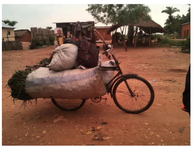
Photo 4: Due to extremely poor road conditions, bicycles are the main means of transportation to bring agricultural produce and charcoal from rural areas to towns and markets.