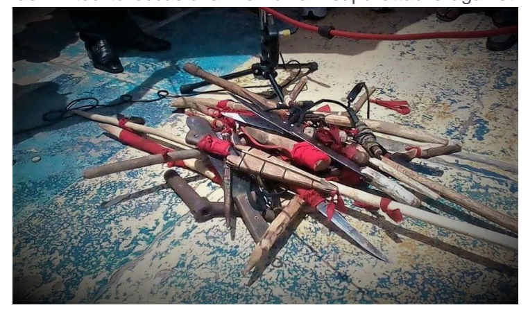
Photo 2: Typical Kamuina Nsapu weapons – sticks, machetes, knives handed in during demobilization of a Kamuina Nsapu group in 2017

This low-grade conflict continued until early 2019, when the swearing in of Félix Tshisekedi, a "son of the Kasaï", as Congo's new president was seen as a victory by Kamuina Nsapu groups and many of them decided to lay down their arms. While this positive dynamic opens up space for reconciliation, conflict resolution, reconstruction, and longer-term peacebuilding, the situation in parts of Kasaï and Kasaï Central remains fragile since none of the underlying problems that led to the violent conflict have been resolved.