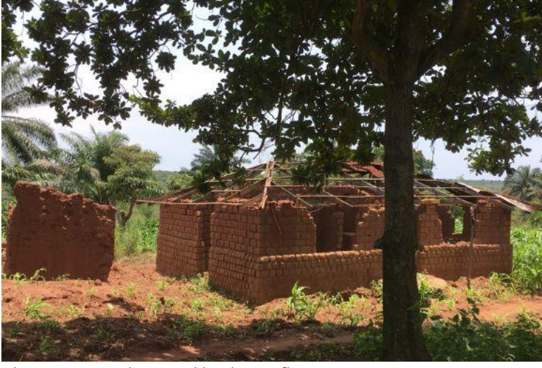
displacement and inter-ethnic tensions, Photo 3: House destroyed by the conflict in Kamonia, Kasaï province

boundaries or over the exploitation of natural resources need to be tackled comprehensively to build durable peace. Existing conflict mappings of all the localized conflicts by the provincial ministries of interior and civil society organizations such as TDH need the reviewed and updated by experts to identify conflicts at the highest risk of reescalation. Mediated local dialogues to deal with high-risk conflicts that had previously turned violence should be put in place and, if possible, agreements between conflicting the parties signed reconciliation ceremonies held. In area of