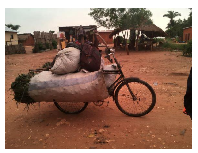
Photo 4: Due to extremely poor road conditions, bicycles are the main means of transportation to bring agricultural produce and charcoal from rural areas to towns and markets.