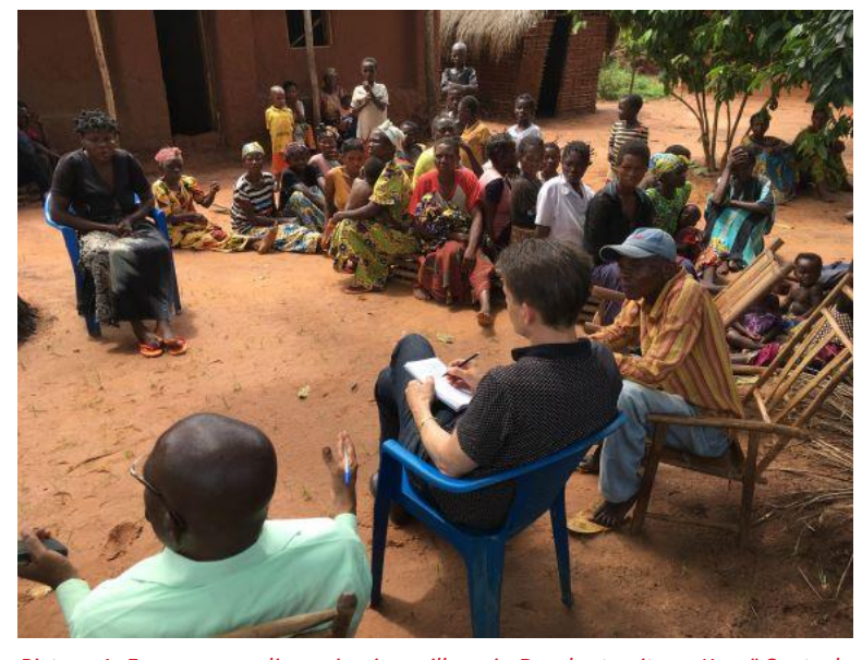
Picture 1: Focus group discussion in a village in Demba territory, Kasaï Central

Origins: The Kasaï conflict started as a local dispute over the nomination of a customary chief of Bashila Kasanga groupement in Dibaya territory, Kasaï Central province, also known as the Kamuina Nsapu. The conflict was between chief Jean-Prince Pandi, designated as chief Kamuina Nsapu by the ruling family, and the provincial and national governments, who imposed a different