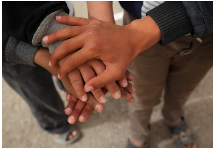
Jordan

Community involvement serves multiple purposes. First, it helps adolescents hone their life, project-management and transferable skills through real-life application of those skills. Second, by enhancing community spaces, adolescents are increasing their ownership of these spaces and the likelihood that they will use them for constructive activities. Third, by getting involved in their communities, adolescents will increasingly be recognized and respected by adults for their contributions, and seen as assets for future community development. Fourth, community projects bring together Syrian refugees and host-community adolescents to work side-by-side to improve shared community concerns. This shared sense of responsibility and accomplishment builds constructive relationships that are based on a mutual recognition of skills and assets. As more of these relationships are created the differences that fuel social tension erode and the likelihood of conflict can be diminished.