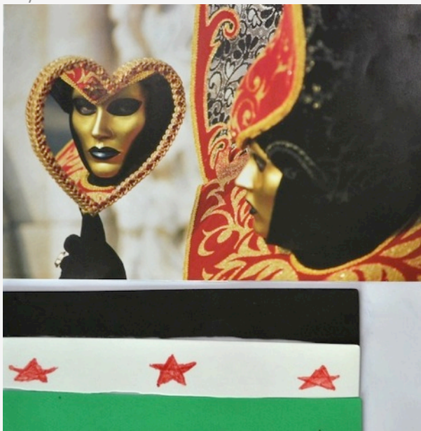
Collage by Syrian Adolescent, Jordan

This intense focus on their homeland is not a bad thing and is what currently matters most to these youth. When it interferes with identifying productive ways to spend time in their host communities, however, it can impede the growth and development that will help them in their host communities or if/when they return to Syria.