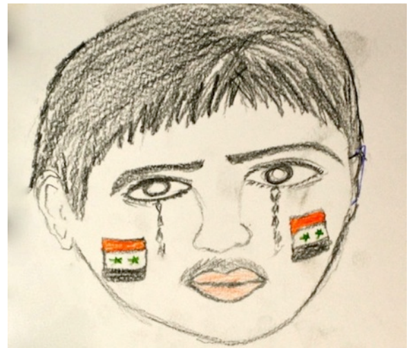
Drawing by Female Adolescent, Lebanon

More than one million Syrian children who are under the age of 18 and are living outside Syria continue to miss educational and life milestones. Among these children, 68 percent are not attending school. 6 Inside Syria, more than half of school-age children (2.8 million) are out of school. 7 Missing these milestones will continue to deny Syria and the region of the productive, wage-earning youth and adults it needs to stabilize tensions and drive future social and economic development for decades to come. Adolescents are not being reached in significant numbers by current programming — which is often conducted through schools and refugee camps — because they are often working or kept at home and the majority do not live in camps. While there are encouraging signs that the international community is beginning to look with more depth into the unique needs of adolescents, 8 more needs to be done in the immediate future.