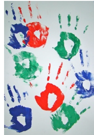
Painting by Male Adolescent, KRI

All adolescent groups were keenly interested in broadening their social support networks. Psychosocial support programming that provides opportunities for individual and collective expression through sport and creative activities can reduce isolation and marginalization and build bonds among peers. These expressive activities also provide an essential building block for establishing trust, building self-esteem and confidence, and encouraging teamwork. These programs should be group-based, mix Syrian and host-community adolescents when feasible, and be facilitated by trained and trusted Syrian and host-community mentors of the same sex and ethnic background and who speak the same language as the adolescents they work with. Facilitators should also be trained and prepared to manage tensions between Syrians and host-community adolescents, as well as Syrian adolescents with differing political viewpoints.