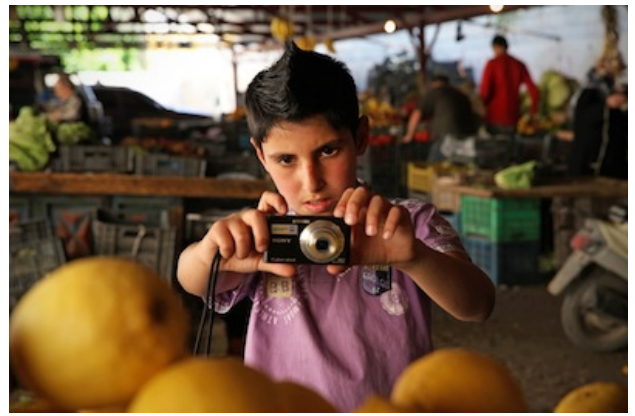
An adolescent in Lebanon.

not a comprehensive account of all of the issues affecting this population. Other important issues, some of which are well documented, include but are not limited to Gender-Based Violence (GBV), adolescents in conflict with the law, juvenile justice, and rights violations experienced by adolescents inside or while leaving Syria or in their host communities. Mercy Corps recommends that existing literature on these and other issues be used, and if not available, that more in-depth and targeted analysis be carried out in order for programs to address these issues adequately when designing and implementing programs with this population.